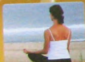
Health & Wellness