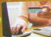
Savings & Discounts

This is an advertisement to join or renew your AARP membership, and not addressed to a particular individual or household. If you are an AARP member, check your membership card to see if it's time to renew. Dues are not deductible for income tax purposes. One membership includes spouse/partner. Annual dues include $4.03 for a subscription to AARP The Magazine , $3.08 for the AARP Bulletin . Dues outside U.S. domestic mail limits: Canada and Mexico – 1 year/$17, all other countries – 1 year/$28. We may steward your resources by converting your check into an electronic deposit. Please allow 3-4 weeks for delivery of membership kit and premium. When you join, AARP shares your membership information with the companies we have selected to provide AARP member benefits, companies that support AARP operations, and select non-profit organizations. If you don't want us to share your information with providers of AARP member benefits or non-profit organizations, please let us know by calling 1-800-433-7419 or visit: help.aarp.org and discover the new ways you can get support from us at AARP.