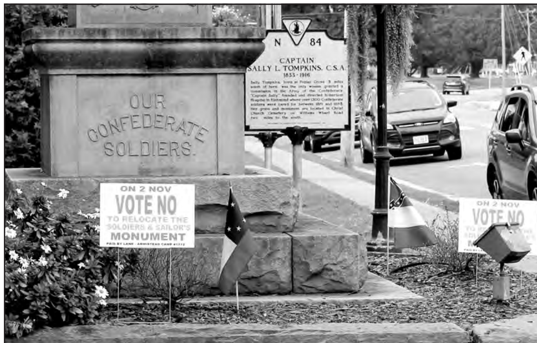
The fate of Mathews County’s Confederate monument is on this year’s ballot. Signs urging residents to “Vote No” on the referendum were back at the base of the monument this week.